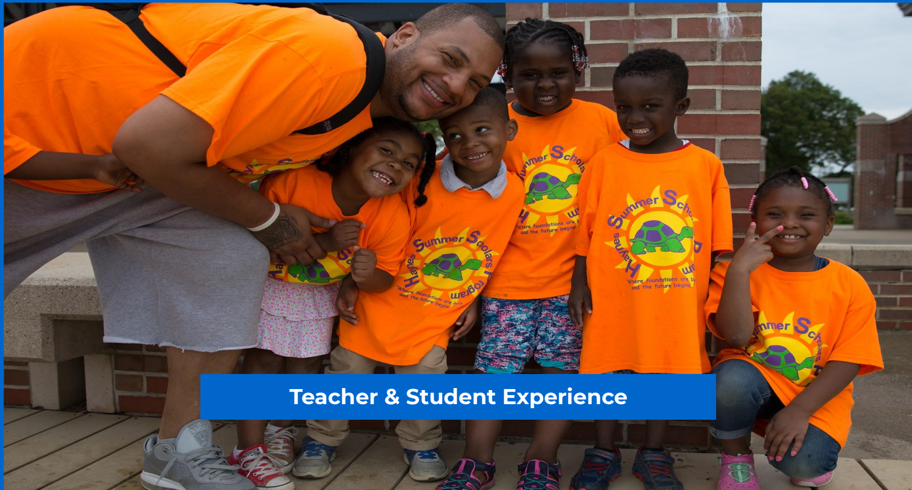
Teacher & Student Experience