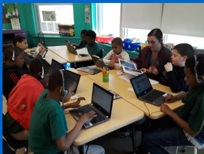
Codaynta, P.A. Maktabadda Shaw