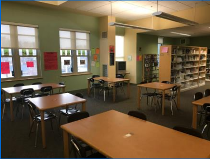
Cusboonaysiinta Maktabadda Dugsiga Mildred Avenue K-8