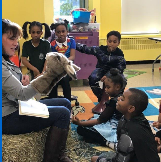
Barnaamijka Saaxiibada Beeraha