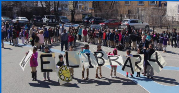
Maalinta Maktabadda Dugsiga Qaranka P.A. Iskuulka Hoose ee Shaw