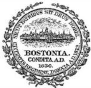
Boston Mayor's Office