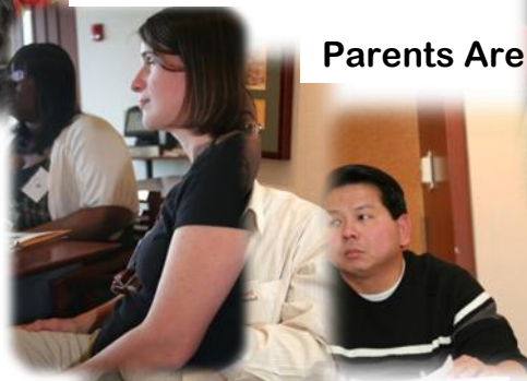
Parents Are Learners