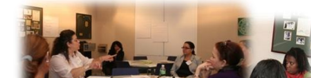
Parents Are Advocates